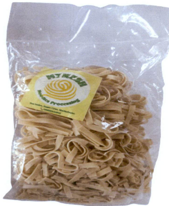
Figure 1. Unregistered MYKESH NOODLES PROCESSING Noodles

The Food and Drug Administration (FDA) warns all healthcare professionals and the general public NOT TO PURCHASE AND CONSUME the unregistered food product: