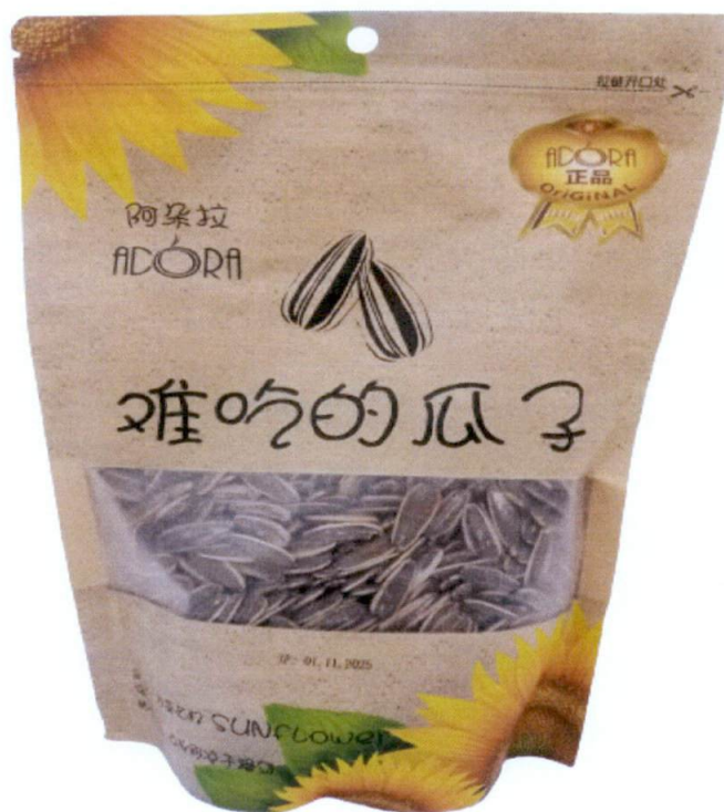
Figure 1. Unregistered ADORA Sunflower Seeds Original

The Food and Drug Administration (FDA) warns all healthcare professionals and the general public NOT TO PURCHASE AND CONSUME the unregistered food product: