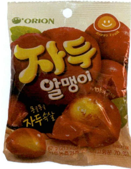
Figure 1. Unregistered ORION Product in Red and White Packaging with Plum-like Image (In Foreign Language)

The Food and Drug Administration (FDA) warns all healthcare professionals and the general public NOT TO PURCHASE AND CONSUME the unregistered food product: