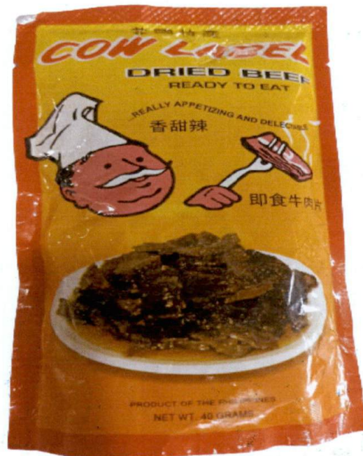
Figure 1. Unregistered COW LABEL Dried Label

The Food and Drug Administration (FDA) warns all healthcare professionals and the general public NOT TO PURCHASE AND CONSUME the unregistered food product: