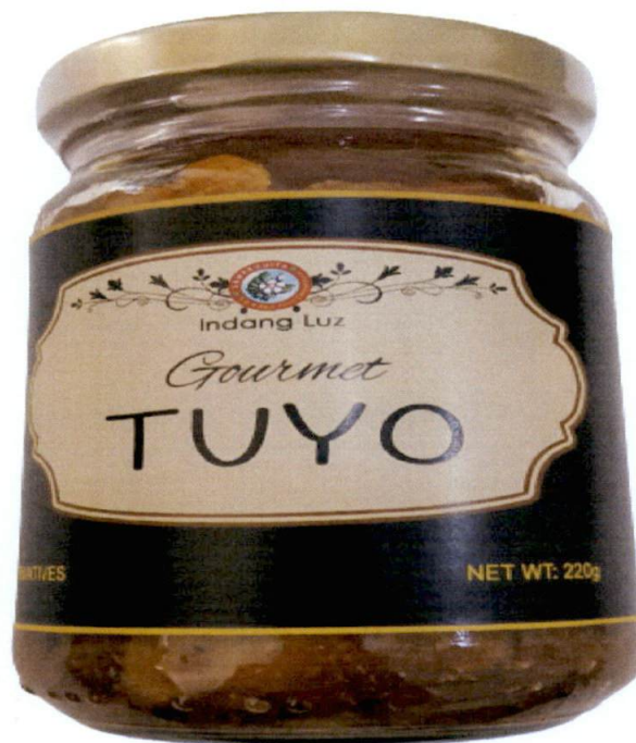
Figure 1. Unregistered INDANG LUZ Gourmet Tuyo

The Food and Drug Administration (FDA) warns all healthcare professionals and the general public NOT TO PURCHASE AND CONSUME the unregistered food product: