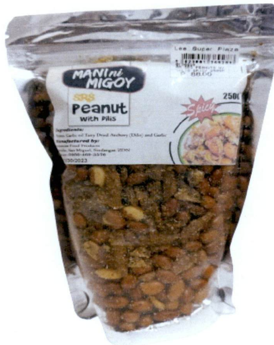
Figure 1. Unregistered MANI NI MIGOY SRS Peanut with Dilis

The Food and Drug Administration (FDA) warns all healthcare professionals and the general public NOT TO PURCHASE AND CONSUME the unregistered food product: