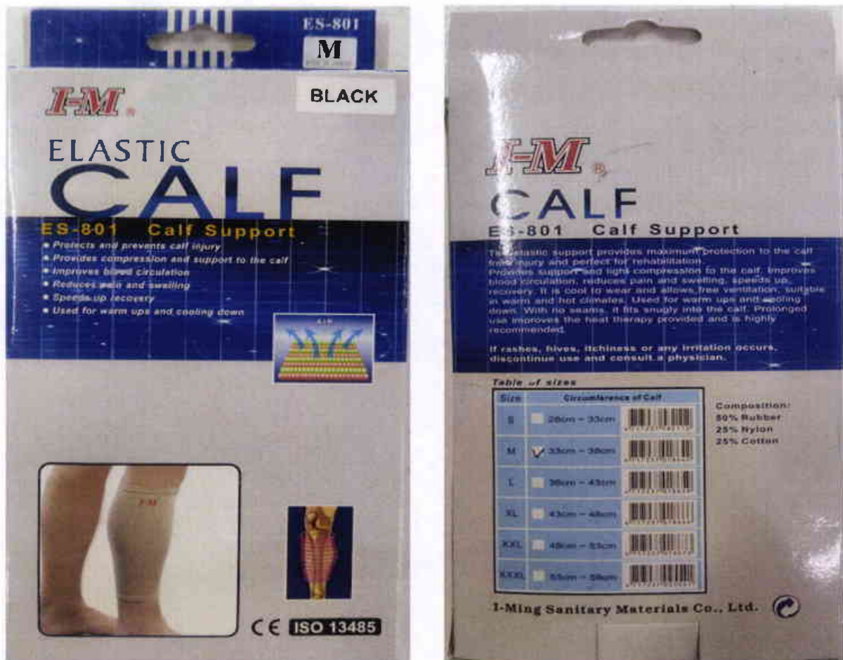
Figure 1. Unnotified I-M® Elastic Calf Support

The Food and Drug Administration (FDA) warns all healthcare professionals and the general public NOT TO PURCHASE AND USE the following unnotified medical device products: