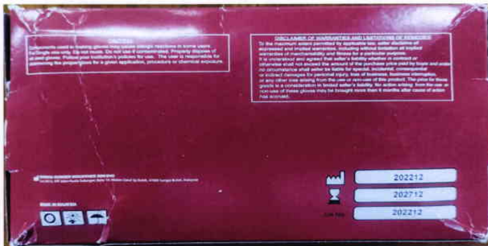
Figure 2. Unnotified Medx Latex Examination Gloves

The FDA verified through post-marketing surveillance that the abovementioned medical device product are not notified and no corresponding Product Notification Certificates have been issued. Pursuant to the Republic Act No. 9711, otherwise known as the “Food and Drug Administration Act of 2009”, the manufacture, importation, exportation, sale, offering for sale, distribution, transfer, non-consumer use, promotion, advertising or sponsorship of health products without the proper authorization is prohibited.