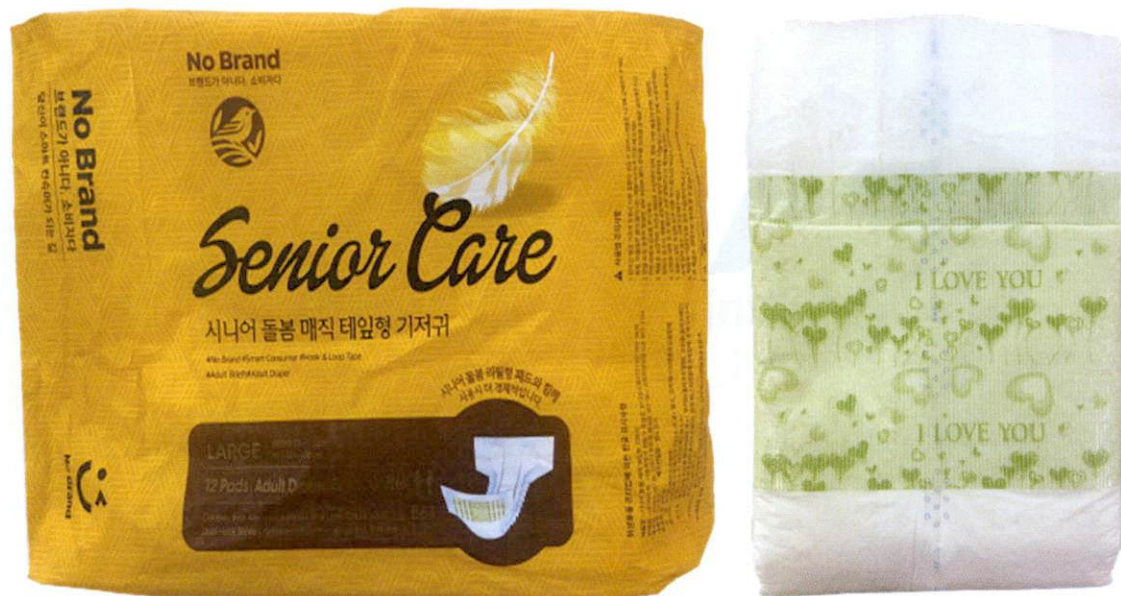
Figure 1. Unnotified No Brand Large 12 Pads Adult Diaper Briefs / Unisex

The Food and Drug Administration (FDA) warns all healthcare professionals and the general public NOT TO PURCHASE AND USE the unnotified medical device product: