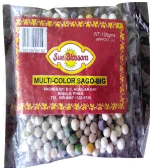
Figure 1. Unregistered SUN BLOSSOM Multi-Color Sago-Big

The Food and Drug Administration (FDA) warns all healthcare professionals and the general public NOT TO PURCHASE AND CONSUME the unregistered food product: