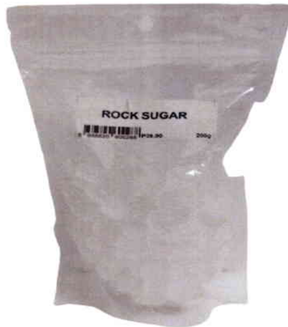
Figure 1. Unregistered UNBRANDED Rock Sugar

The Food and Drug Administration (FDA) warns all healthcare professionals and the general public NOT TO PURCHASE AND CONSUME the unregistered food product: