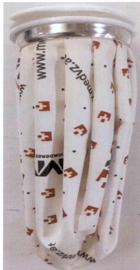
Figure 1. Rx Dr. Care™ Ice Bag Rubberized