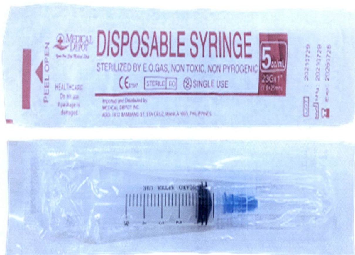
Figure 1. Unregistered Medical Depot Disposable Syringe

The Food and Drug Administration (FDA) warns all healthcare professionals and the general public NOT TO PURCHASE AND USE the unregistered medical device product: