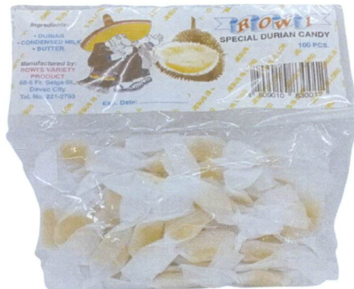
Figure 1. Unregistered ROWI Special Durian Candy

The Food and Drug Administration (FDA) warns all healthcare professionals and the general public NOT TO PURCHASE AND CONSUME the unregistered food product: