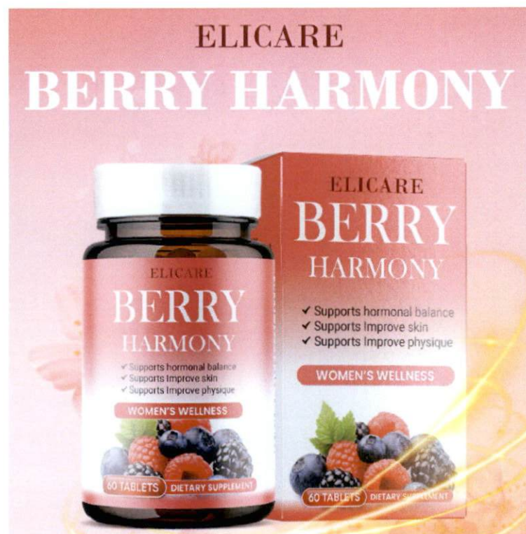
Figure 1. Unregistered ELICARE Berry Harmony Dietary Supplement

The Food and Drug Administration (FDA) warns all healthcare professionals and the general public NOT TO PURCHASE AND CONSUME the unregistered food supplement: