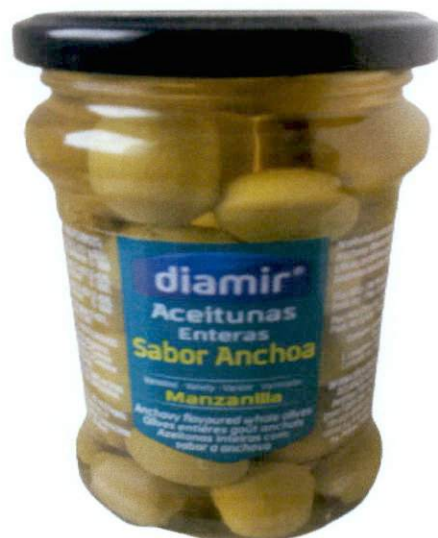
Figure 1. Unregistered DIAMIR Aceitunas Enteras Sabor Anchoa - Manzanilla (Anchovy Flavoured Whole Olives)

The Food and Drug Administration (FDA) warns all healthcare professionals and the general public NOT TO PURCHASE AND CONSUME the unregistered food product: