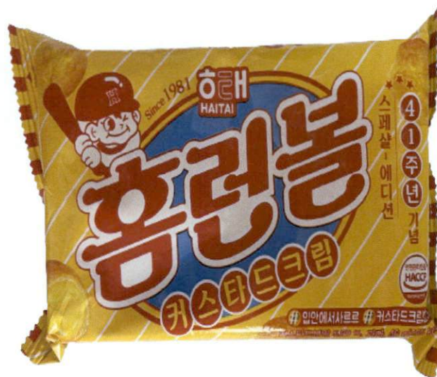
Figure 1. Unregistered HAITAI Product in Yellow, Red and Blue Packaging (In Foreign Language)

The Food and Drug Administration (FDA) warns all healthcare professionals and the general public NOT TO PURCHASE AND CONSUME the unregistered food product: