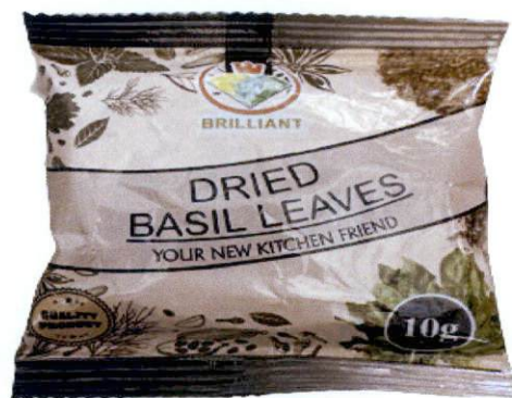
Figure 1. Unregistered BRILLIANT Dried Basil Leaves

The Food and Drug Administration (FDA) warns all healthcare professionals and the general public NOT TO PURCHASE AND CONSUME the unregistered food product: