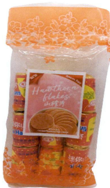
Figure 1. Unregistered SINKHA THIY Hawthorn Flakes

The Food and Drug Administration (FDA) warns all healthcare professionals and the general public NOT TO PURCHASE AND CONSUME the unregistered food product: