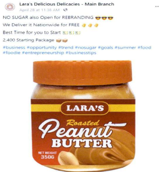
Figure 1. Unregistered LARA'S Roasted Peanut Butter

The Food and Drug Administration (FDA) warns all healthcare professionals and the general public NOT TO PURCHASE AND CONSUME the unregistered food product: