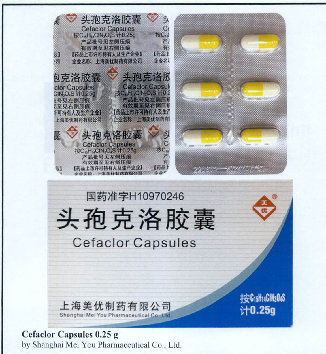
Cefaclor Capsules 0.25 g by Shanghai Mei You Pharmaceutical Co., Ltd.

The Food and Drug Administration (FDA) advises the public against the purchase and use of the unregistered drug product: