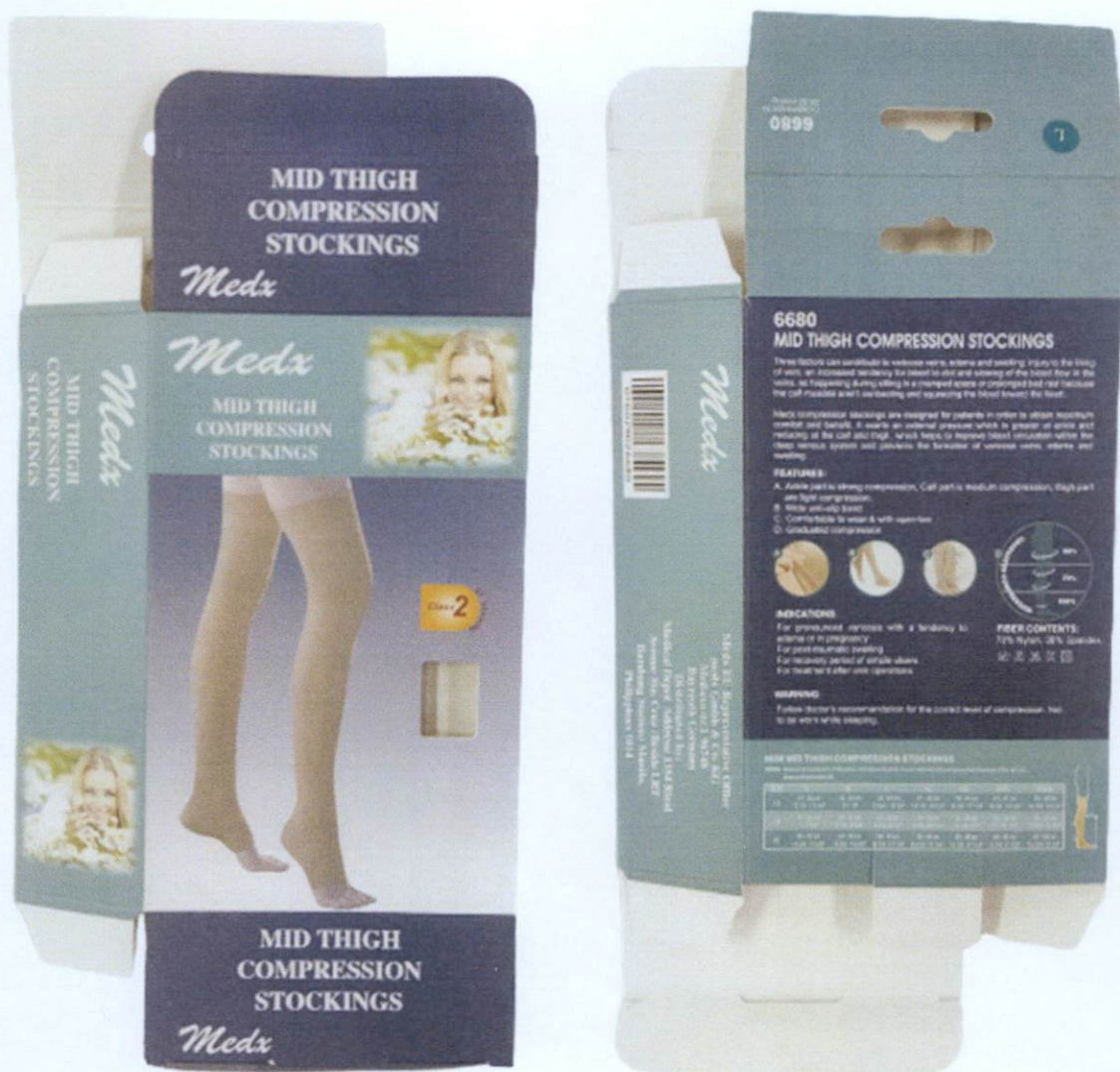
Figure 2. Unnotified Medx Mid Thigh Compression Stockings

The FDA verified through post-marketing surveillance that the abovementioned medical device products are not notified, and no corresponding Product Notification Certificates have been issued. Pursuant to the Republic Act No. 9711, otherwise known as the “Food and Drug Administration Act of 2009”, the manufacture, importation, exportation, sale, offering for sale, distribution, transfer, non-consumer use, promotion, advertising, or sponsorship of health products without the proper authorization is prohibited.