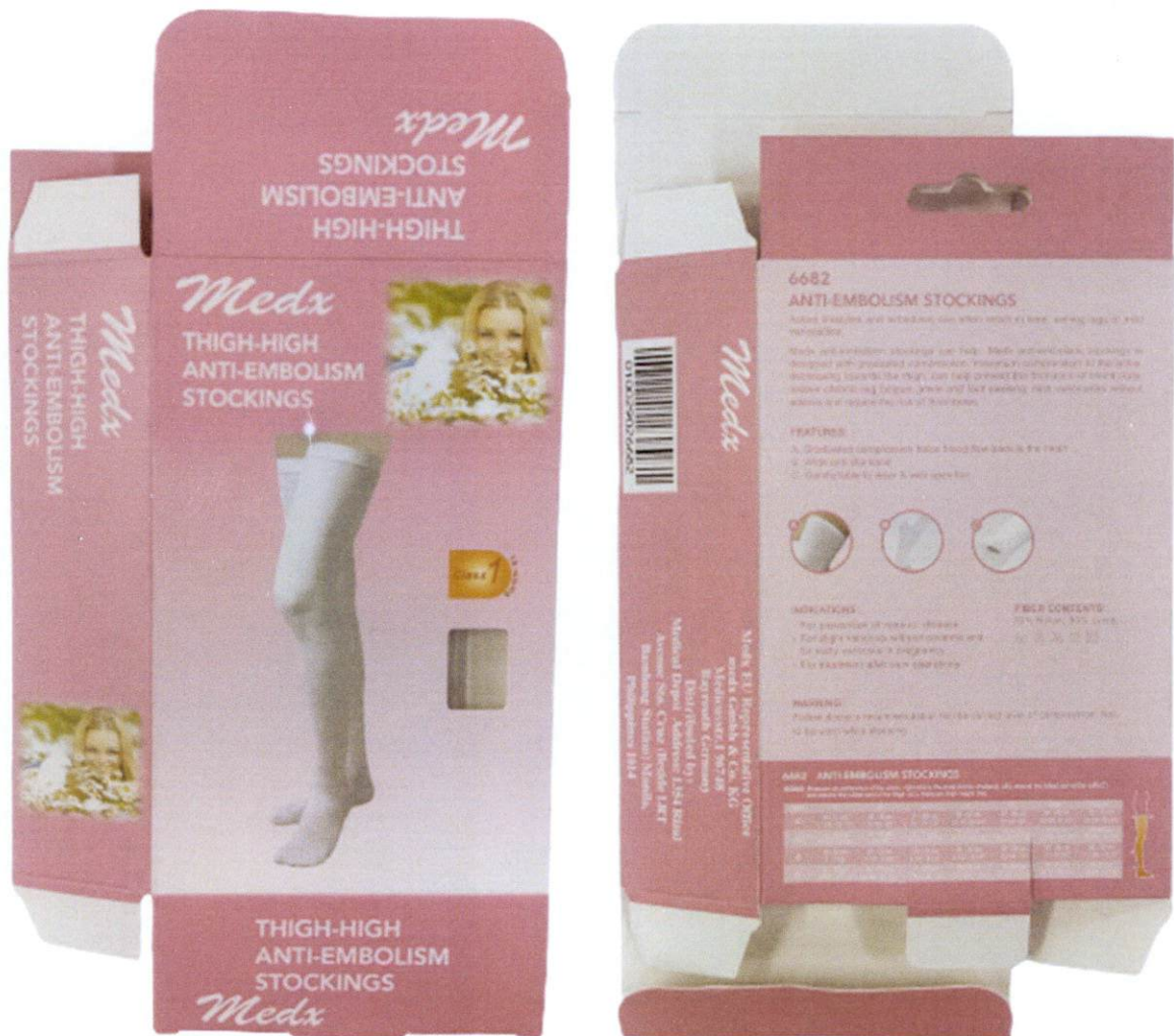
Figure 1. Unnotified Medx Thigh-High Anti-Embolism Stockings

The Food and Drug Administration (FDA) warns all healthcare professionals and the general public NOT TO PURCHASE AND USE the following unnotified medical device products: