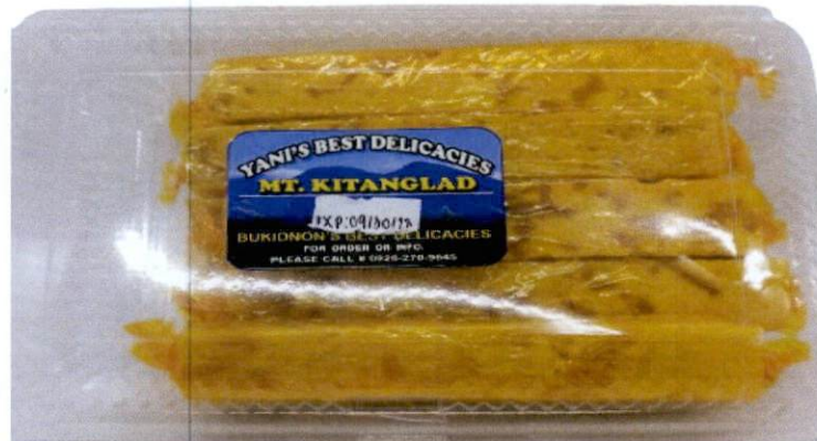
Figure 1. Unregistered YANI'S BEST DELICACIES MT. KITANGLAD Biscuit-like Product Inside Yellow Packaging

The Food and Drug Administration (FDA) warns all healthcare professionals and the general public NOT TO PURCHASE AND CONSUME the unregistered food product: