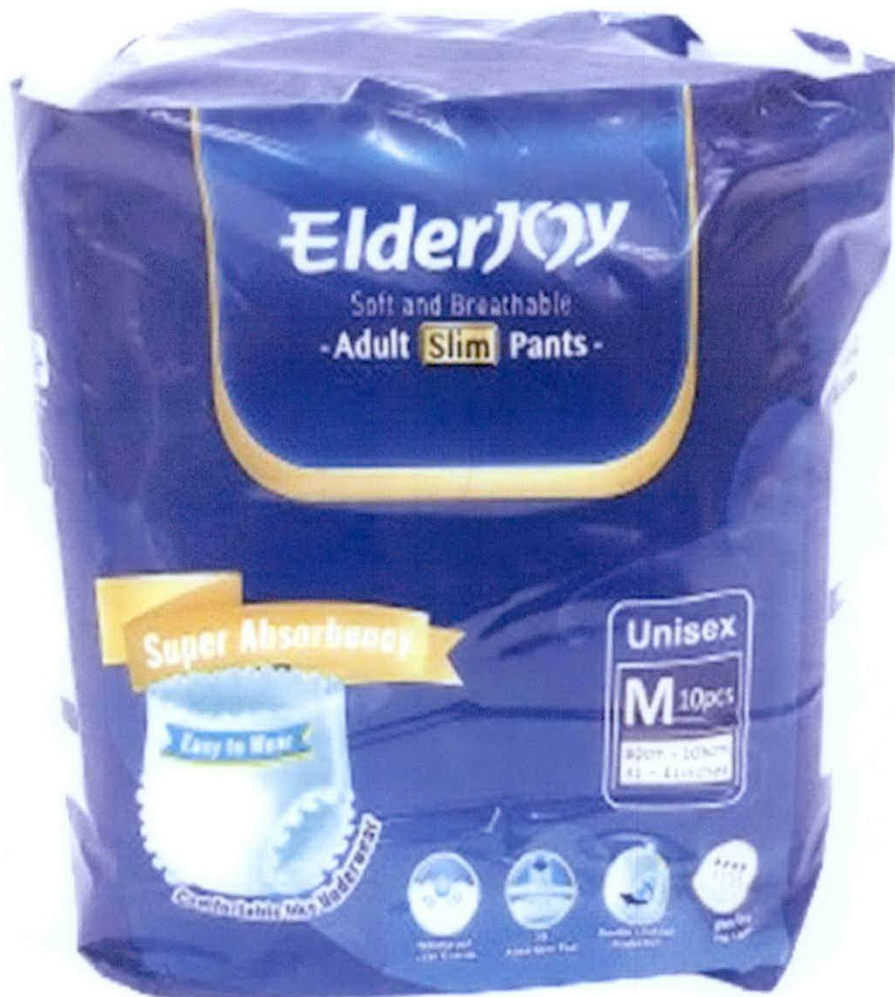
Figure 1. Unnotified Elderjoy Adult Slim Pants – M

The Food and Drug Administration (FDA) warns all healthcare professionals and the general public NOT TO PURCHASE AND USE the unnotified medical device products: