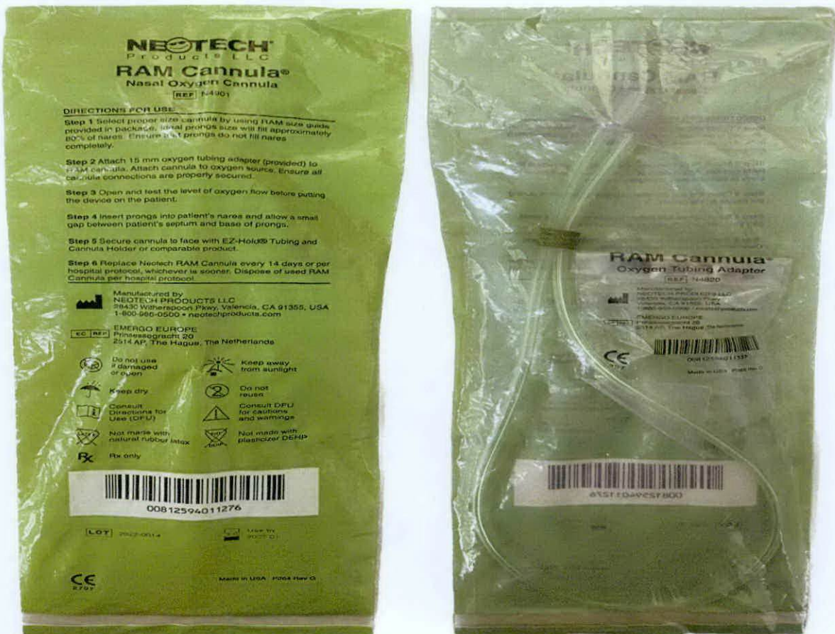
Figure 1. Unregistered RAM Cannula® Nasal Oxygen Cannula

The Food and Drug Administration (FDA) warns all healthcare professionals and the general public NOT TO PURCHASE AND USE the unregistered medical device product: