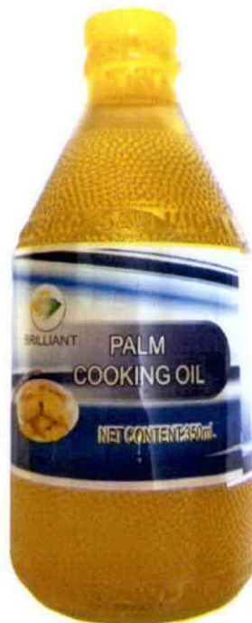
Figure 1. Unregistered BRILLIANT Palm Cooking Oil

The Food and Drug Administration (FDA) warns all healthcare professionals and the general public NOT TO PURCHASE AND CONSUME the unregistered food product: