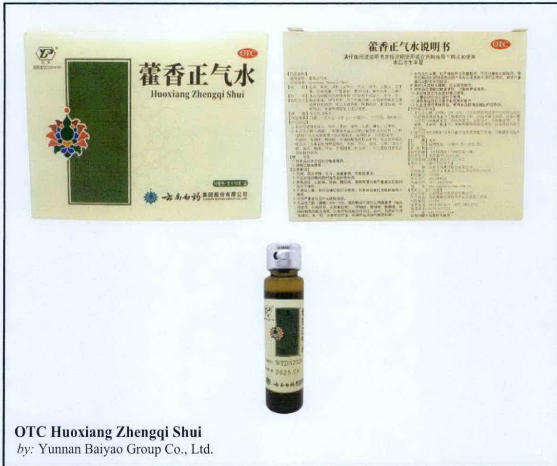
OTC Huoxiang Zhengqi Shui by: Yunnan Baiyao Group Co., Ltd.