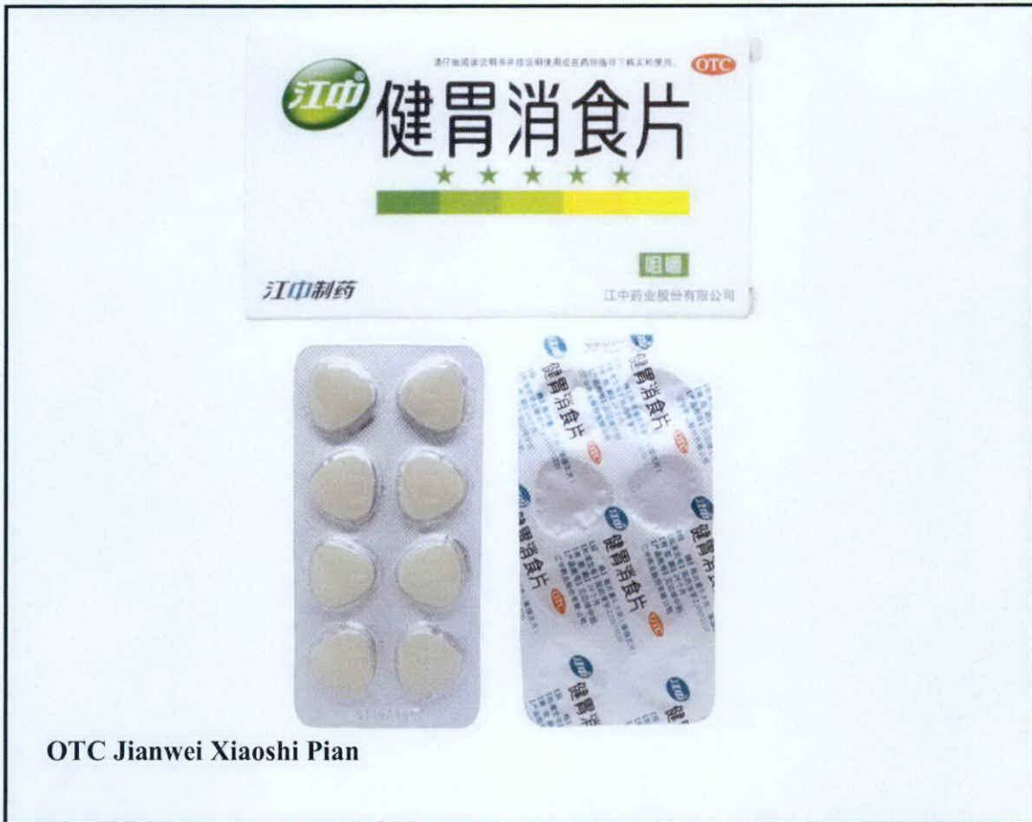
OTC Jianwei Xiaoshi Pian