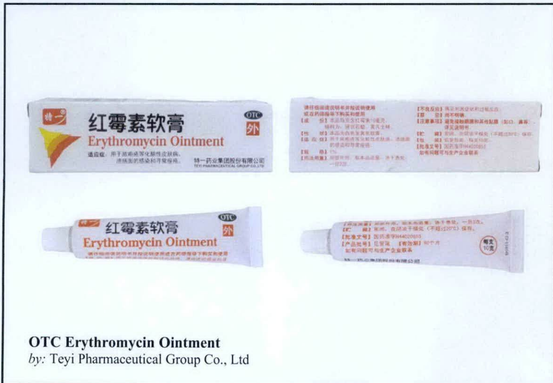
OTC Erythromycin Ointment by: Teyi Pharmaceutical Group Co., Ltd