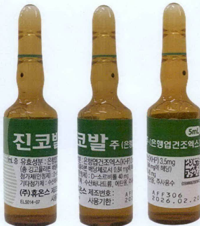
Houns Ethical Ginkobal Inj. (Ginkgo Leaf Dried Extract) 17.5 mg/5mL Manufactured by: Huons Co. Ltd. -100 Bio Valley-ro, Jecheon-si, Chungcheongbuk-do (as translated)