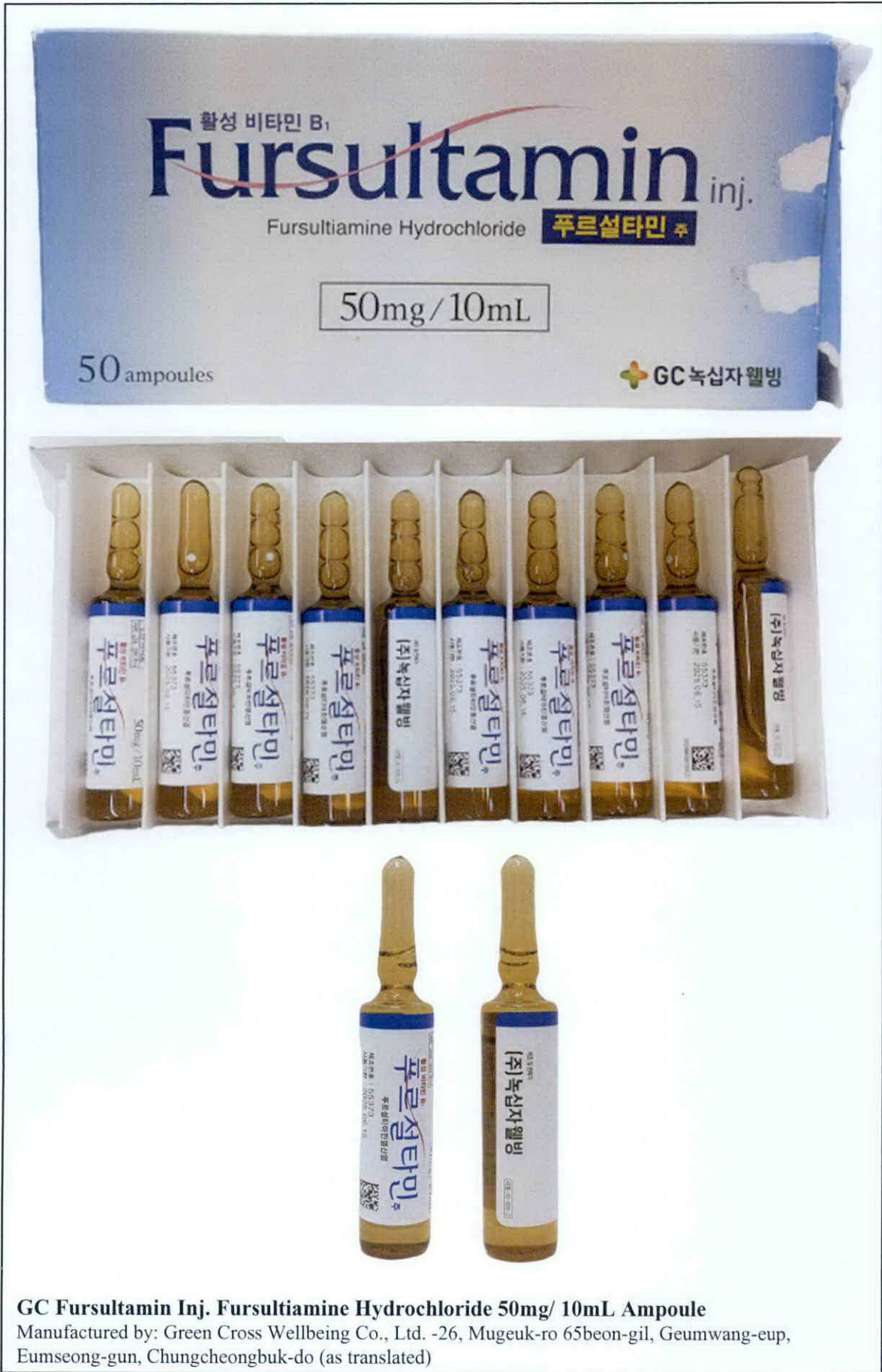
GC Fursultamin Inj. Fursultiamine Hydrochloride 50mg/ 10mL Ampoule Manufactured by: Green Cross Wellbeing Co., Ltd. -26, Mugeuk-ro 65beon-gil, Geumwang-eup, Eumseong-gun, Chungcheongbuk-do (as translated)