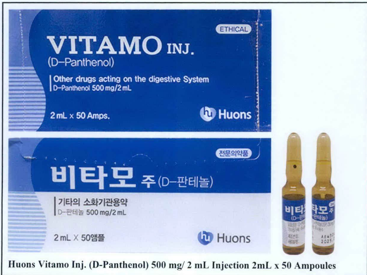
Huons Vitamo Inj. (D-Panthenol) 500 mg/ 2 mL Injection 2mL x 50 Ampoules