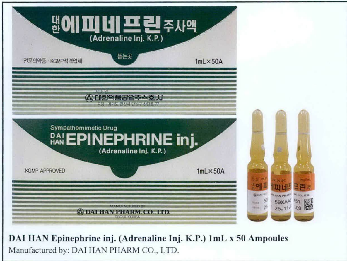
DAI HAN Epinephrine inj. (Adrenaline Inj. K.P.) 1mL x 50 Ampoules Manufactured by: DAI HAN PHARM CO., LTD.