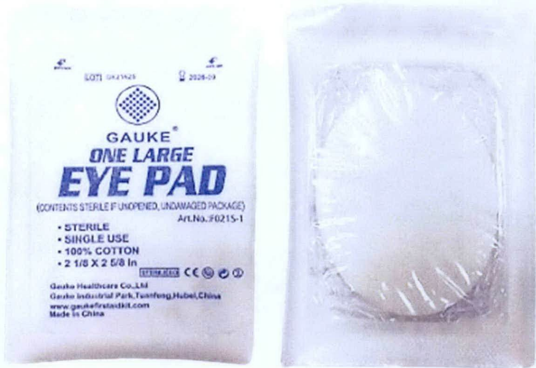
Figure 2. Unnotified Gauke® One Large Eye Pad