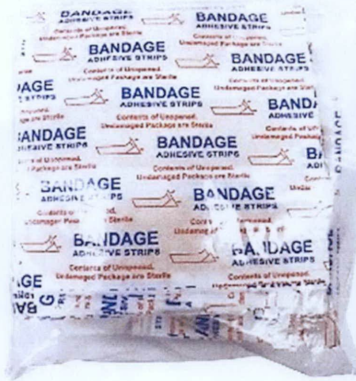
Figure 8. Unnotified Bandage Adhesive Strips