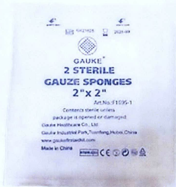
Figure 7. Unnotified Gauke ® 2 Sterile Gauze Sponges 2" x 2"