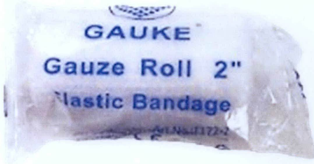
Figure 4. Unnotified Gauke® Gauze Roll Elastic Bandage