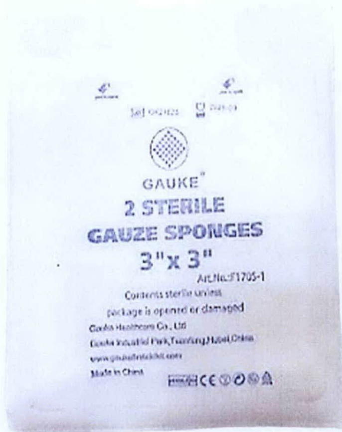
Figure 6. Unnotified Gauke ® 2 Sterile Gauze Sponges 3" x 3"