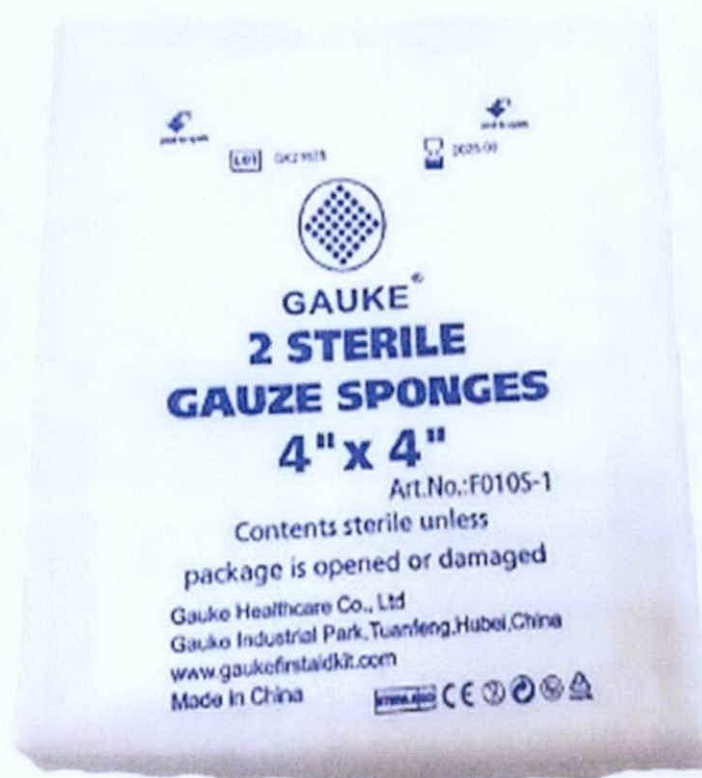
Figure 5. Unnotified Gauke® 2 Sterile Gauze Sponges 4\" x 4\"