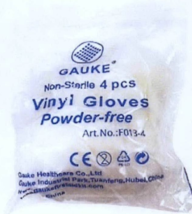
Figure 9. Unnotified Gauke® Non-Sterile Vinyl Gloves Powder-free