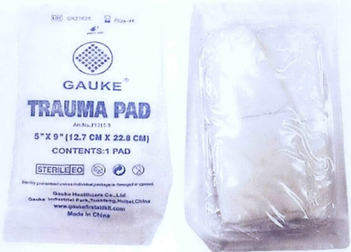
Figure 3. Unnotified Gauke® Trauma Pad