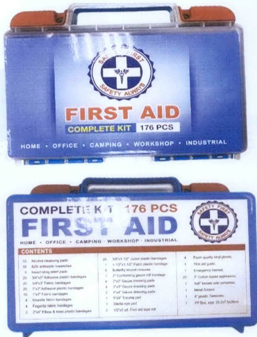
Figure 1. Unnotified FIRST AID COMPLETE KIT

The Food and Drug Administration (FDA) warns all healthcare professionals and the general public NOT TO PURCHASE AND USE the unnotified medical device products: