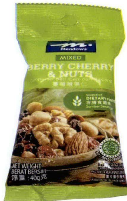
Figure 1. Unregistered MEADOWS Berry Cherry & Nuts Mixed

The Food and Drug Administration (FDA) warns all healthcare professionals and the general public NOT TO PURCHASE AND CONSUME the unregistered food product: