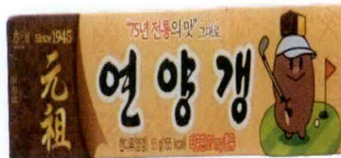
Figure 1. Unregistered HAITAI Product Name in Foreign Language in Brown and Dark Brown Packaging with Illustration of a Golfer

The Food and Drug Administration (FDA) warns all healthcare professionals and the general public NOT TO PURCHASE AND CONSUME the unregistered food product: