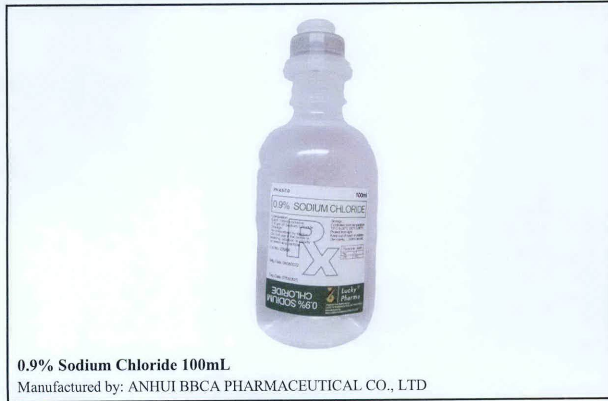
0.9% Sodium Chloride 100mL Manufactured by: ANHUI BBKA PHARMACEUTICAL CO., LTD