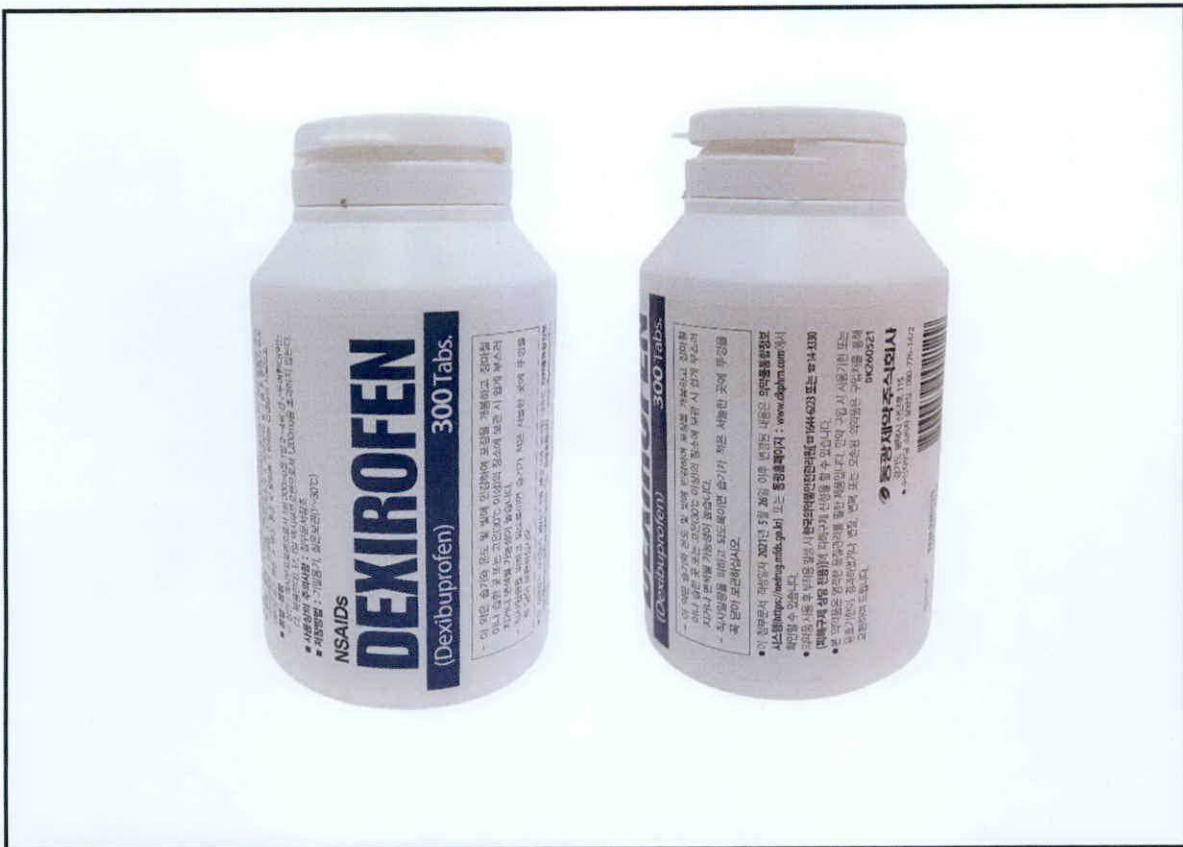
NSAIDs Dexirofen (Dexibuprofen) Tablet