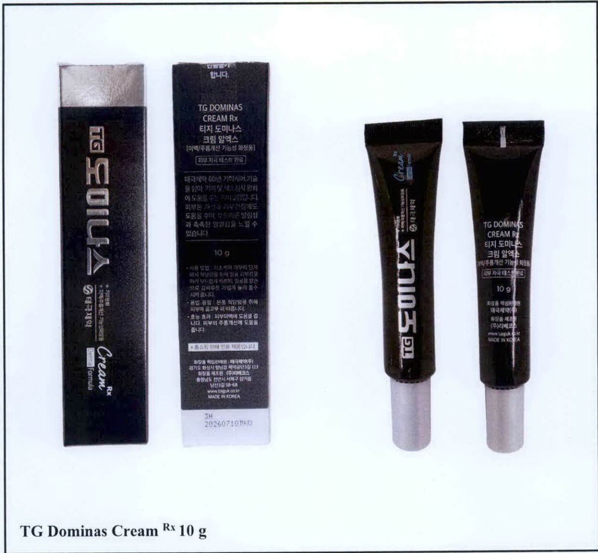
TG Dominas Cream Rx 10 g