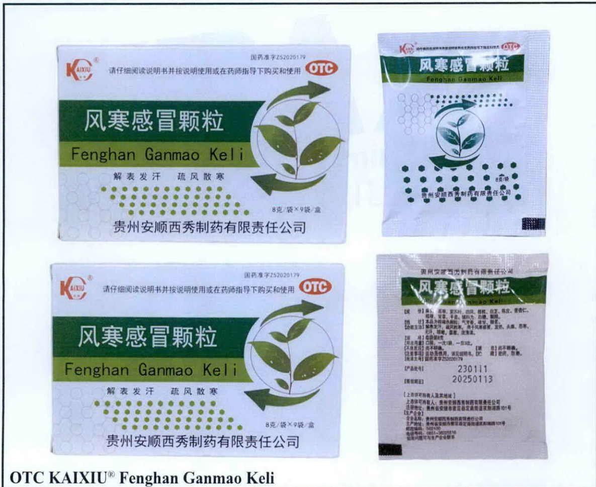
OTC KAIXIU® Fenghan Ganmao Keli

The Food and Drug Administration (FDA) advises the public against the purchase and use of the following unregistered drug products: