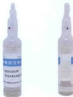
Calcium Gluconate Injection 10 mL Ampoule