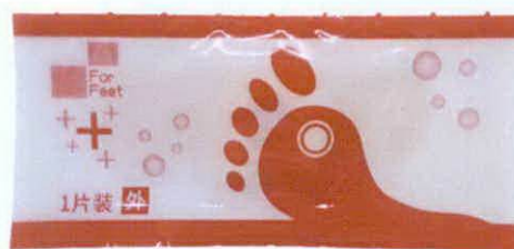
Qian Jiang Ji Yan Zu Bu Tie