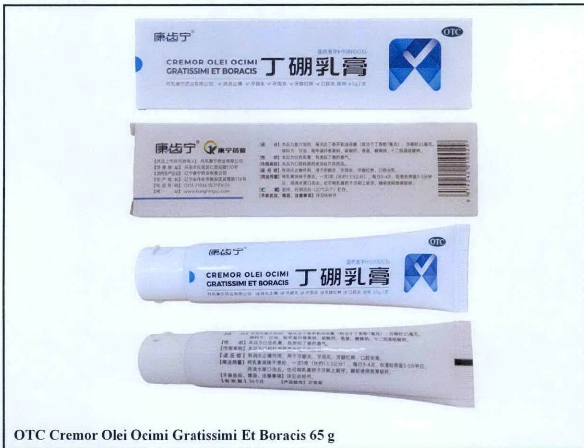
OTC Cremor Olei Ocimi Gratissimi Et Boracis 65 g