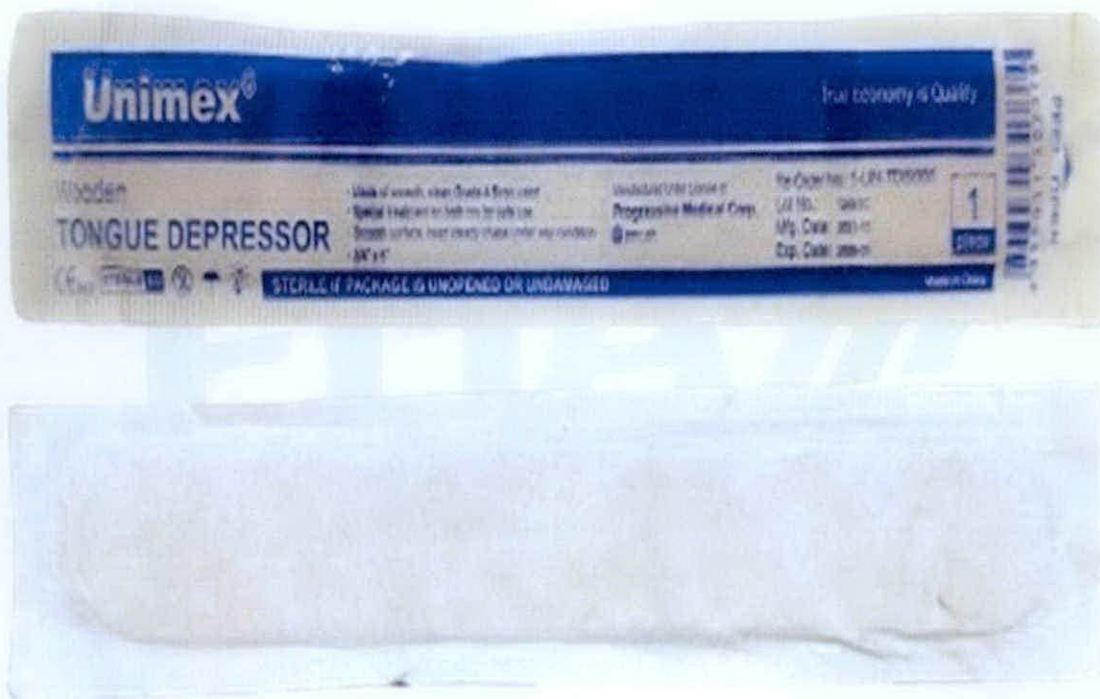
Figure 1. Unnotified Unimex® Wooden Tongue Depressor

The Food and Drug Administration (FDA) warns all healthcare professionals and the general public NOT TO PURCHASE AND USE the unnotified medical device product: