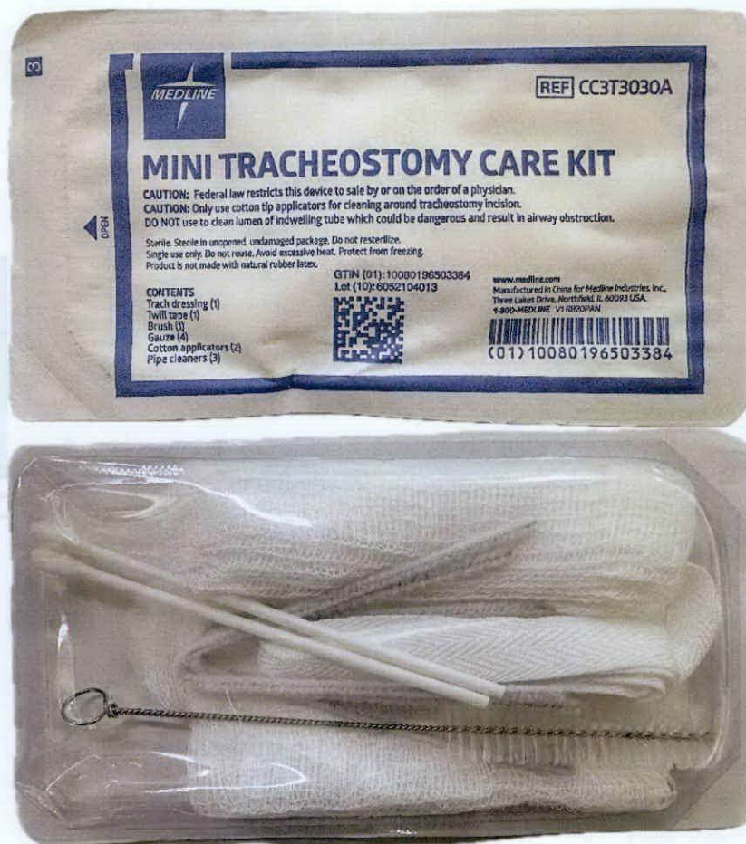
Figure 1. Unnotified Medline Mini Tracheostomy Care Kit

The Food and Drug Administration (FDA) warns all healthcare professionals and the general public NOT TO PURCHASE AND USE the unnotified medical device product: