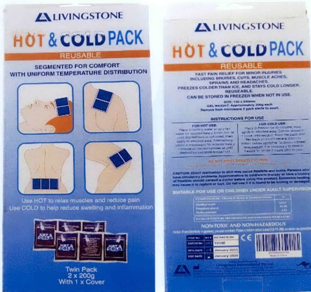
Figure 1. Unnotified Livingstone Hot and Cold Pack Reusable

The Food and Drug Administration (FDA) warns all healthcare professionals and the general public NOT TO PURCHASE AND USE the unnotified medical device product: