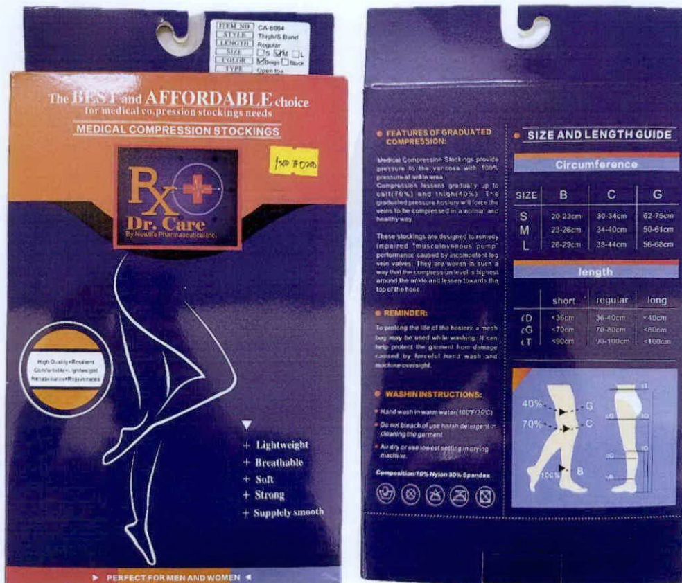
Figure 1. Unnotified RX Dr. Care Medical Compression Stockings

The Food and Drug Administration (FDA) warns all healthcare professionals and the general public NOT TO PURCHASE AND USE the unnotified medical device product: