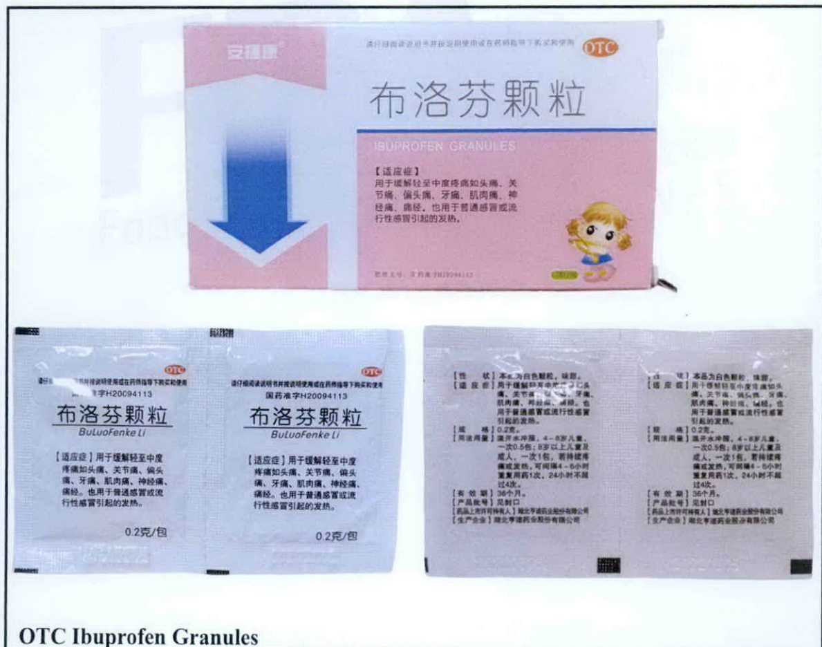
OTC Ibuprofen Granules

The Food and Drug Administration (FDA) advises the public against the purchase and use of the following unregistered drug products: