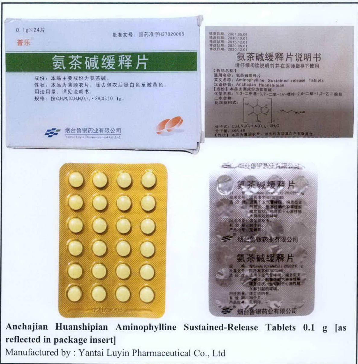
Anchajian Huanshipian Aminophylline Sustained-Release Tablets 0.1 g [as reflected in package insert]

Manufactured by : Yantai Luyin Pharmaceutical Co., Ltd