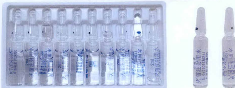
Hasen Sterile Water for Injection 2mL Manufactured by: Shanghai Xiandai Hasen (Shangqui) Pharmaceutical Co., Ltd.