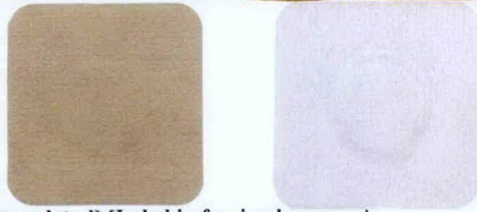
Zang Jikang® (as translated) [Label in foreign language]