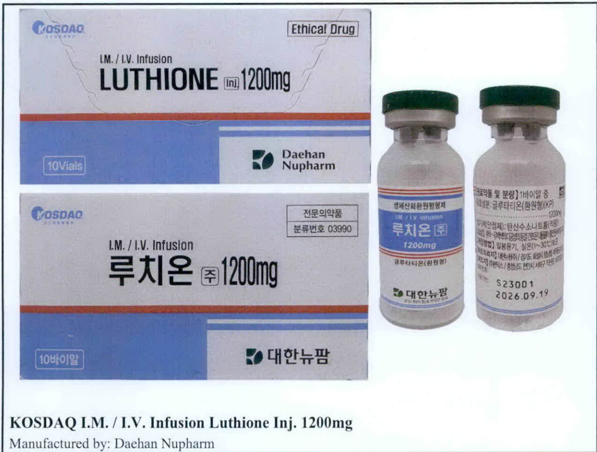
KOSDAQ I.M. / I.V. Infusion Luthione Inj. 1200mg Manufactured by: Daehan Nupharm