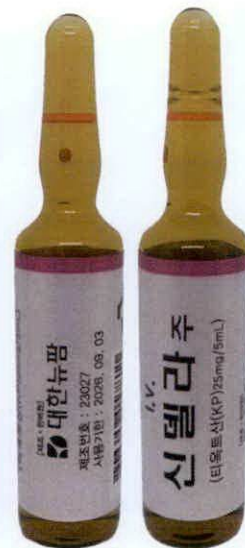
KOSDAQ Cindella Inj. I.V. (Thioctic acid 25mg/5mL) 10 ampoules Manufactured by: Daehan Nupharm