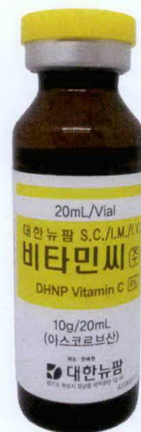
KOSDAQ DHNP S.C./I.M./I.V. Vitamin C Inj. Ascorbic Acid 10g/20mL 10 vials Manufactured by: Daehan Nupharm