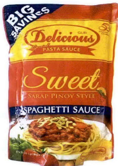
Figure 1. Unregistered DELICIOUS SPECIAL PASTA SAUCE Sweet Sarap Pinoy Style - Spaghetti Sauce

The Food and Drug Administration (FDA) warns all healthcare professionals and the general public NOT TO PURCHASE AND CONSUME the unregistered food product: