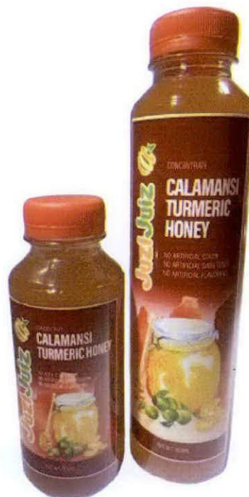
Figure 1. Unregistered JUZI JUIZ Calamansi Turmeric Honey

The Food and Drug Administration (FDA) warns all healthcare professionals and the general public NOT TO PURCHASE AND CONSUME the unregistered food product: