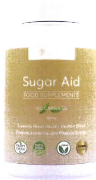
Figure 1. Unregistered NATURETHICS Sugar Aid Food Supplements

The Food and Drug Administration (FDA) warns all healthcare professionals and the general public NOT TO PURCHASE AND CONSUME the unregistered food supplement: