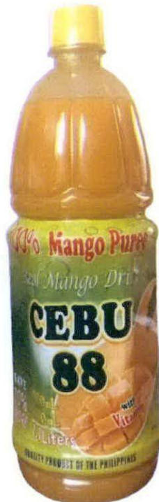
Figure 1. Unregistered CEBU 88 100% Mango Puree Real Mango Drink

The Food and Drug Administration (FDA) warns all healthcare professionals and the general public NOT TO PURCHASE AND CONSUME the unregistered food product: