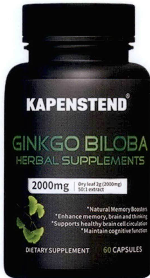
Figure 1. Unregistered KAPENSTEND Ginkgo Biloba Herbal Supplements Dietary Supplement

The Food and Drug Administration (FDA) warns all healthcare professionals and the general public NOT TO PURCHASE AND CONSUME the following unregistered food supplement: