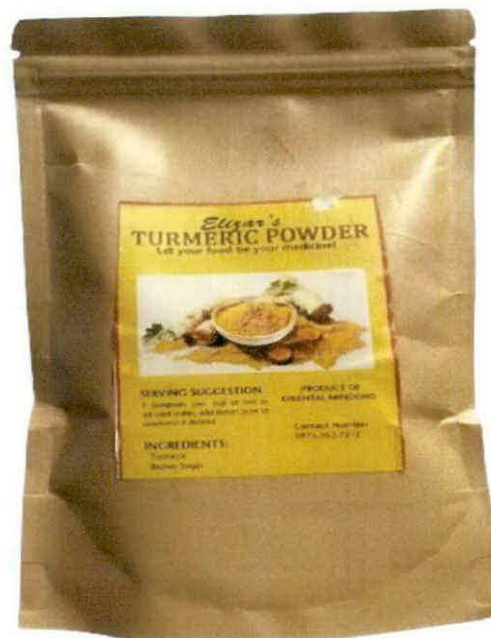
Figure 1. Unregistered ELIZAR'S Turmeric Powder

The Food and Drug Administration (FDA) warns all healthcare professionals and the general public NOT TO PURCHASE AND CONSUME the unregistered food product: