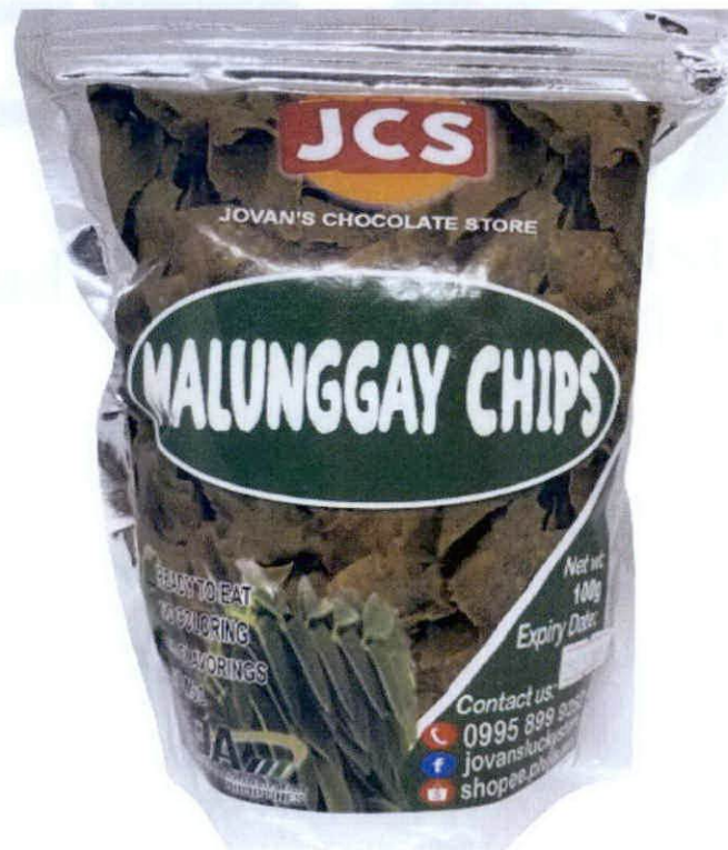
Figure 1. Unregistered JCS JOVAN'S CHOCOLATE STORE Malunggay Chips

The Food and Drug Administration (FDA) warns all healthcare professionals and the general public NOT TO PURCHASE AND CONSUME the unregistered food product: